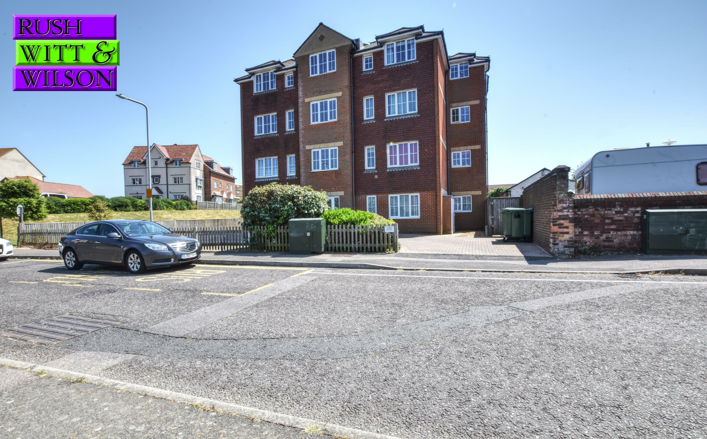
Trinity Court Ashdown Road, Bexhill-On-Sea, East Sussex TN40 1SW £229,000